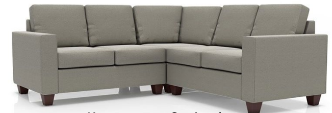
Keystone 3 x 3 Sectional UKS-SEC-3 87W X 87D X 34H