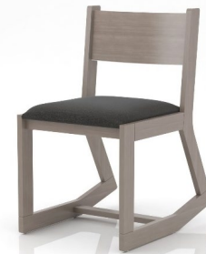
Two-Position Upholstered Seat TPC-WBUS 19W X 25D X 34H