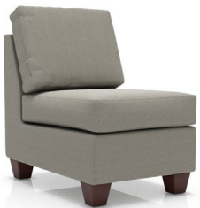
Keystone Armless Chair UKS-ACH 23W X 35D X 34H

Woven Polypropylene, also known as Olefin, is strong, fade-resistant, and inherently stain resistant. It's soft, lightfast, and easy to clean because polypropylene has no active dye sites.