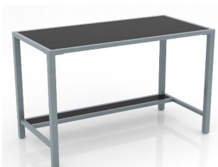
Cornerstone Writing Desk*