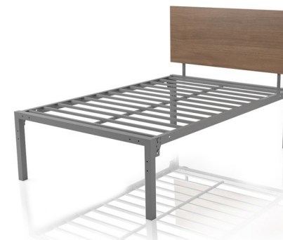
Apex Headboard Full AX-HB-F 53.275W x 2D x 28H Twin and Twin-XL 36W x 2D x 28H Queen 60W x 2D x 33H