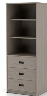
Franklin 3-Drawer 3-Shelf Wardrobe FR-OWR3-222472 22W X 24D X 72H