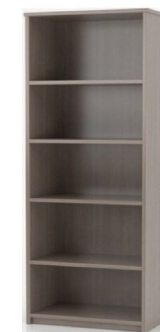
Franklin Five Shelf Bookcase FR-BK5-302430 24W X 15D X 60H