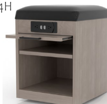
Pedestal One-Drawer with Outlet and Extendable Shelf FR-P1-101118-01 10W X 11D X 11H