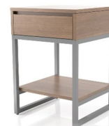
Apex Nightstand AX-NS1-181826-01 18W x 18D x 26H