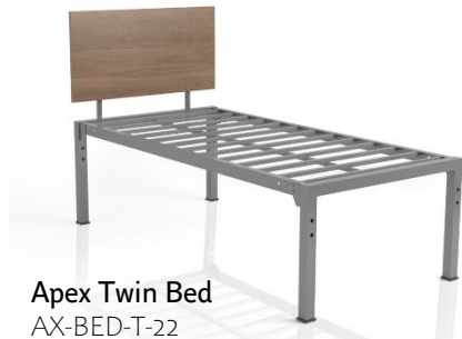
Apex Twin Bed AX-BED-T-22 39W X 77D X 58H Free Standing Beds and Laminate Headboards available in TXL, Full, FXL and Queen