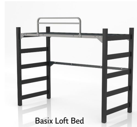
Basix Loft Bed BX-LFT60-TXL 38.5W X 85.75D X 60H Loft Beds and Loft Kits available with Safety Rail