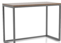
Apex Writing Desk* AX-WDF-402030 40W x 20D x 30H