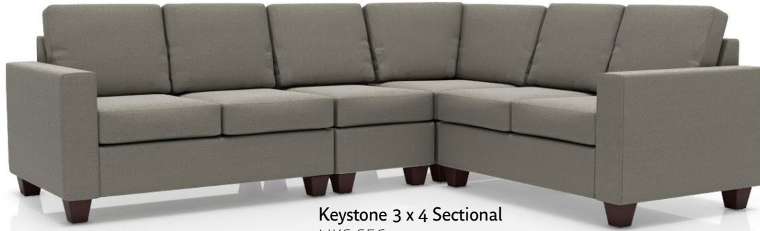
Keystone 3 x 4 Sectional UKS-SEC-34 110W X 87D X 34H