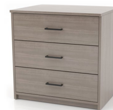
Franklin Chest Three-Drawer