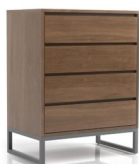
Apex Four-Drawer Chest AX-CH4-341836 34W x 18D x 36H