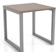
Apex End Table AX-ETF-202020 20W x 20D x 20H