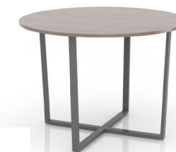
Apex Round Dining Table AX-DTR-3630-X 36W x 30H AX-DTR-4230-X 42W x 30H