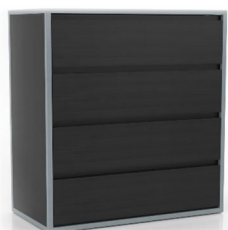
Cornerstone Chest Four-Drawer