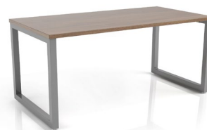
Apex Coffee Table AX-CTF-402018 40W x 20D x 18H