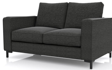
Park Loveseat UP-LUV 58W X 35D X 31H