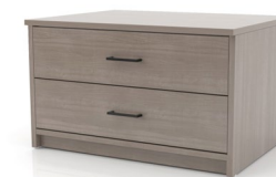
Franklin Chest Two-Drawer*