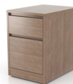
Apex Mobile Pedestal AX-MP2-162224 16W x 22D x 24H