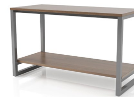
Apex Media Unit AX-MU-401824 40W x 18D x 24H