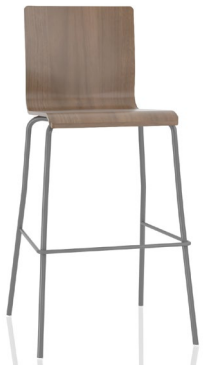
Bent Plywood Bar Stool/Counter Stool BS-12 18W X 20D X 42H CS-12 18W X 20D X 31H