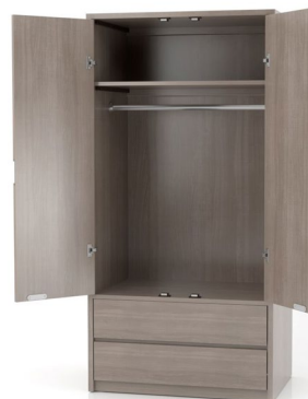
Franklin Wardrobe Two-Drawer*