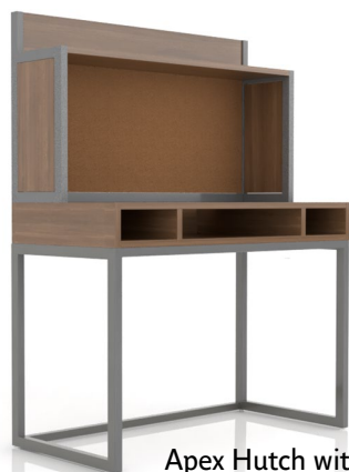
Apex Hutch with Corkboard AX-WDF-421224 42W X 12D X 24H