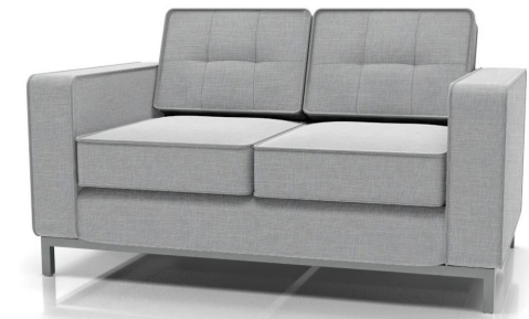
Manhattan Loveseat UMHT-LUV 58W X 35D X 32H