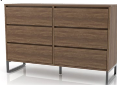
Apex Six-Drawer Chest AX-CH6-541836 54W x 18D x 36H