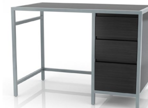
Cornerstone Pedestal Desk Three-Drawer