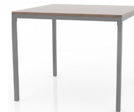
Apex Dining Table AX-DT-363630 36W x 36D x 30H