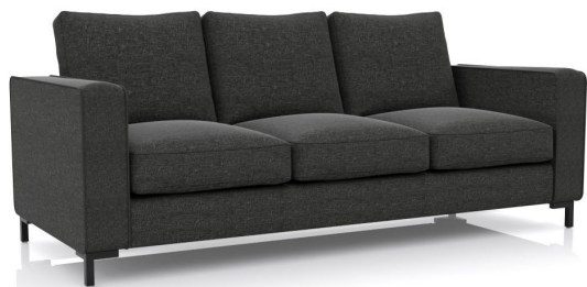
Park Sofa UP-SOF 77W X 35D X 31H