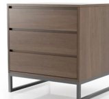
Apex Three-Drawer Chest AX-CH3-302430 30W x 24D x 30H