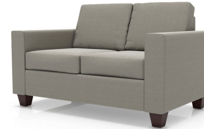
Keystone Loveseat UKS-LUV 58W X 35D X 34H