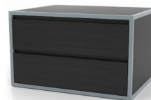
Cornerstone Chest Two-Drawer