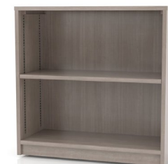
Franklin Mobile Two-Shelf Bookcase FR-BK2C-301330 30W X 13D X 30H