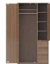
Three-Drawer Wardrobe* AX-WR3-362472 36W x 24D x 72H

* Additional sizes and shelf and drawer options available