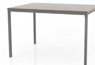
Apex Dining Table AX-DT-483630 48W x 36D x 30H AX-DT-603630 60W x 36D x 30H