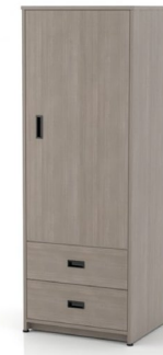
Franklin 2-Drawer Half Wardrobe FR-1WR2-262472 26W X 24D X 72H