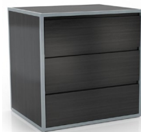
Cornerstone Chest Three-Drawer