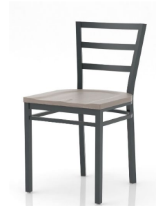
Metal Dining Chair with Wood Seat DC-004 18W X 20D X 32H