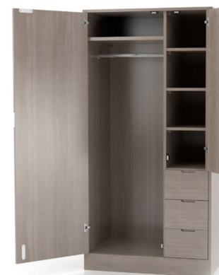
Franklin Wardrobe Three-Drawer