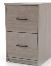
Franklin Mobile Pedestal Two-Drawer*