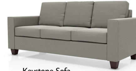
Keystone Sofa UKS-SOF 81W X 35D X 34H