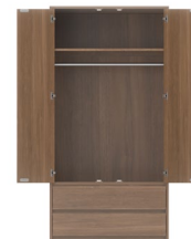
Two-Drawer Wardrobe* AX-WR2-362472 36W x 24D x 72H