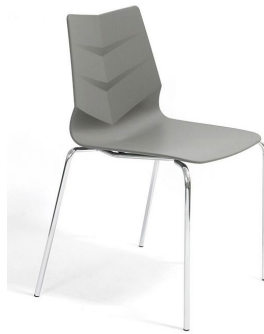
Leaf Desk Chair LEAF-01 22.5W X 20.5D X 33H