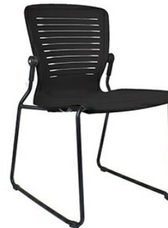
OM Five Chair DC-OM-05 20.5W x 18D x 32.5H