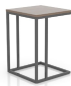
Apex C Tray Table AX-CTT-181825 18W x 18D x 25H