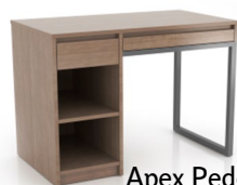
Apex Pedestal Desk* AX-PD2S2-422430 42W x 24D x 30H