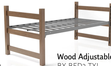
Wood Adjustable Height Bed BX-BED2-TXL 38.5W X 85.75D X 36H Bunkable and Loftable