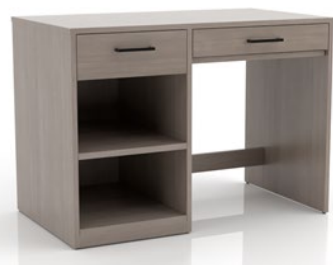
Franklin Pedestal Two-Drawer Two-Shelf Desk

* Additional sizes and shelf and drawer options available