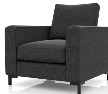
Park Lounge Chair UP-CHR 35W X 35D X 31H