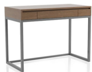
Apex Writing Desk One-Drawer* AX-WD1F-362430 36W x 24D x 30H