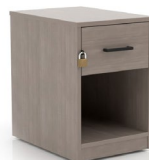
Franklin Mobile Pedestal FR-MP1S2-182430 18W X 24D X 30H