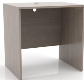
Franklin Writing Desk*