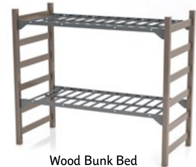
Wood Bunk Bed BX-BED2-TXL 38.5W X 85.75D X 72H Quantity Two