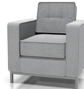
Manhattan Lounge Chair UMHT-CHR 35W X 35D X 32H