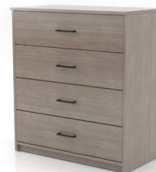
Franklin Chest Four-Drawer