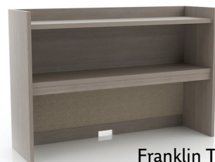
Franklin Two-Shelf Hutch FR-HT2-321224 32W X 12D X 24H