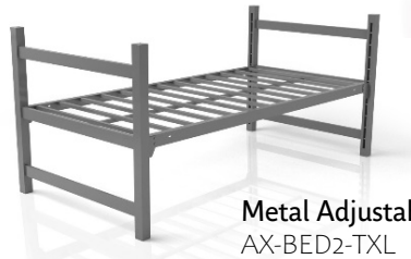
Metal Adjustable Height Bed AX-BED2-TXL 38.5W X 85.75D X 36H Bunkable and Loftable