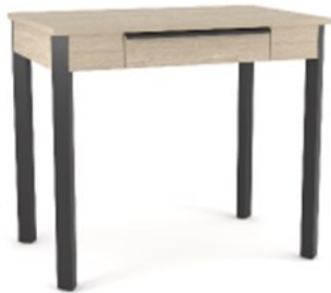
Acacia Writing Desk One-Drawer AC-WD1-342230 34W X 22D X 30H