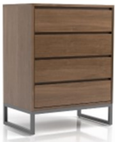
Apex Four-Drawer Chest AX-CH4-341836 34W x 18D x 36H