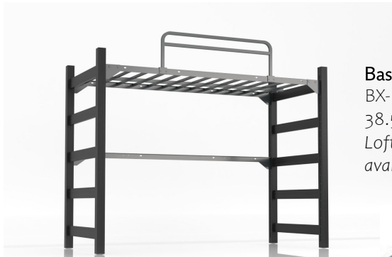
Basix Loft Bed BX-LFT60-T 38.5W X 85.75D X 60H Loft Beds and Loft Kits available with Safety Rail