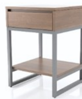
Apex Nightstand AX-NS1-181826-01 18W x 18D x 26H