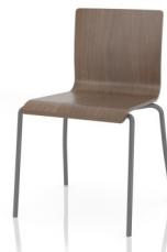
Bent Plywood Dining Chair DC-012 21W X 20D X 31H