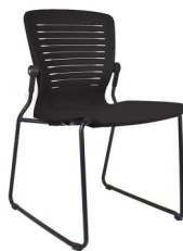
Bunsen Stack Chair DC-013 20.5W X 18D X 32.5H