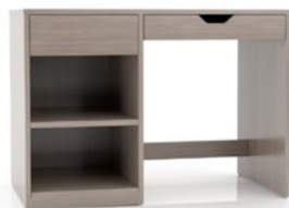
Franklin Pedestal Two Drawer Two-Shelf Desk FR-PD2S-422430 42W x 24D x 30H