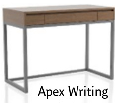
Apex Writing Desk One-Drawer AX-WD1F-362430 36W x 24D x 30H