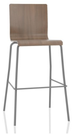
Bent Plywood Bar Stool BS-12 18W X 20D X 42H