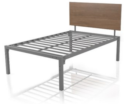
Apex Headboard Full AX-HB-F 53.275W x 2D x 28H