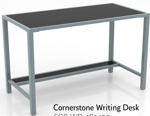
Cornerstone Writing Desk COR-WD-482430 48W X 24D X 30H