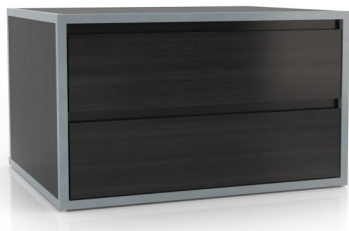
Cornerstone Chest Two-Drawer COR-CH2-302418 30W X 24D X 18H