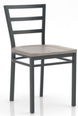
Metal Dining Chair with Wood Seat DC-004 18W X 20D X 32H