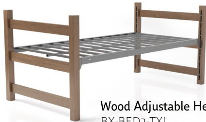
Wood Adjustable Height Bed BX-BED2-TXL 38.5W X 85.75D X 36H Bunkable and Loftable