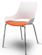
Icon Chair DC-ICON 20.5W X 20.8D X 31.5H