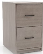
Franklin Mobile Pedestal Two-Drawer FR-MP2-182224 18W x 22D x 24H