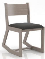
Two-Position Upholstered Seat TPC-WBUS 19W X 25D X 34H