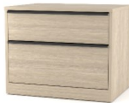
Acacia Two Drawer Chest AX-CH2-262018 26W x 20D x 18H