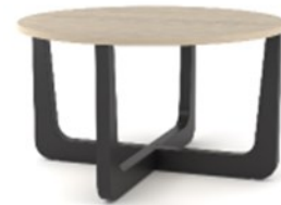
Acacia Coffee Table AC-CTR-3018 30W x 30D x 18H