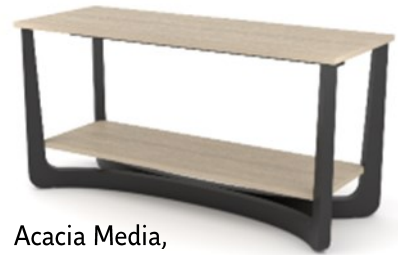
Acacia Media, Console, Entry Unit AC-MU-421824 42W x 18D x 24H