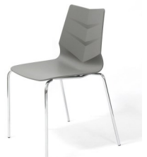
Leaf Desk Chair LEAF-01 22.5W X 20.5D X 33H