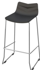
Leaf Bar Stool LEAF-06 21W x 19D x 37H