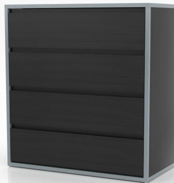
Cornerstone Chest Four-Drawer COR-CH4-341836 34W X 18D X 36H