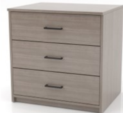
Franklin Chest Three-Drawer FR-CH3-302430 30W X 24D X 30H