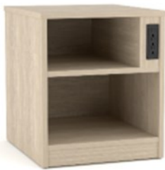
Acacia Bookcase AC-BK2C-182018 18W x 20D x 18H