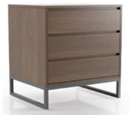
Apex Three-Drawer Chest AX-CH3-302430 30W x 24D x 30H