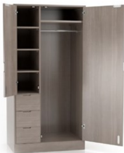
Franklin Wardrobe Three-Drawer FR-WR3-362472 36W x 24D x 72H