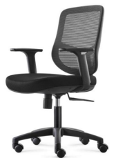
Yak Task Chair TC-YAK 24.6W x 20D