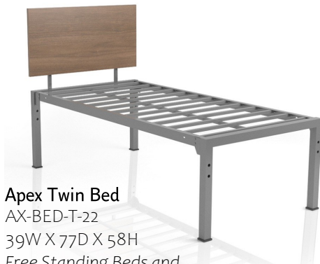
Apex Twin Bed AX-BED-T-22 39W X 77D X 58H Free Standing Beds and Laminate Headboards available in TXL, Full, Full XL and Queen