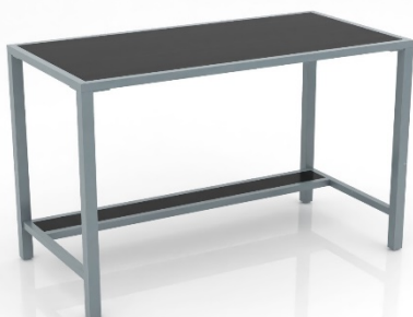
Cornerstone Writing Desk COR-WD-482430 48W X 24D X 30H