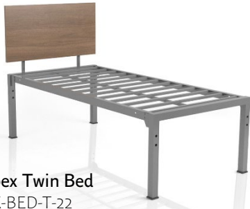
Apex Twin Bed