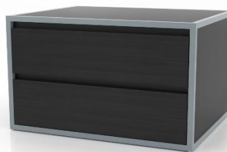
Cornerstone Chest Two-Drawer COR-CH2-302418 30W X 24D X 18H