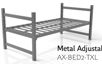
Metal Adjustable Height Bed

Loft Beds and Loft Kits available with Safety Rail