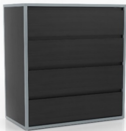
Cornerstone Chest Four-Drawer COR-CH4-341836 34W X 18D X 36H