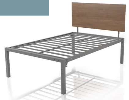
Apex Headboard Full AX-HB-F 53.275W x 2D x 28H