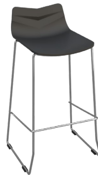
Leaf Bar Stool LEAF-06 21W x 19D x 37H