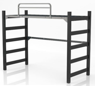
Basix Loft Bed

Free Standing Beds and Laminate Headboards available in TXL, Full, FXL and Queen