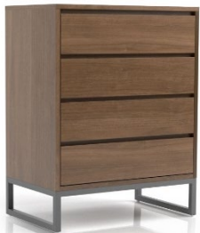
Apex Four-Drawer Chest AX-CH4-341836 34W x 18D x 36H