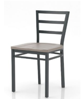
Metal Dining Chair with Wood Seat DC-004 18W X 20D X 32H