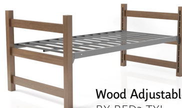
Wood Adjustable Height Bed