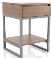
Apex Nightstand AX-NS1-181826-01 18W x 18D x 26H