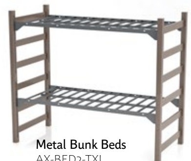
Metal Bunk Beds