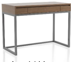
Apex Writing Desk One-Drawer AX-WD1F-362430 36W X 24D X 30H