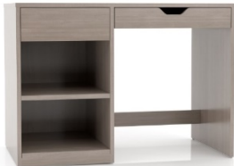
Franklin Pedestal Two-Drawer Two-Shelf Desk FR-PD2S-422430 42W x 24D x 30H