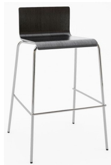
Bent Plywood Counter Low Back CS-12 18W X 20D X 31H