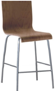
Bent Plywood Bar Stool BS-12 18W X 20D X 42H