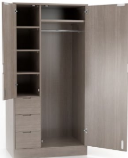
Franklin Wardrobe Three-Drawer FR-WR3-362472 36W x 24D x 72H