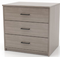
Franklin Chest Three-Drawer FR-CH3-302430 30W X 24D X 30H