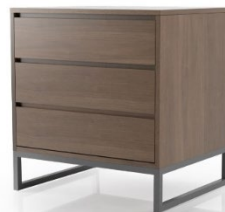
Apex Three-Drawer Chest AX-CH3-302430 30W x 24D x 30H