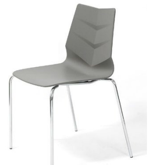
Leaf Desk Chair LEAF-01 22.5W X 20.5D X 33H