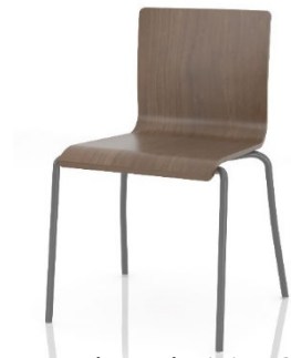
Bent Plywood Dining Chair DC-012 21W X 20D X 31H