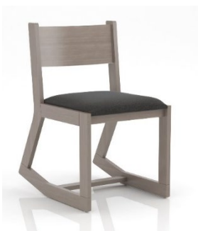
Two-Position Upholstered Seat TPC-WBUS 19W X 25D X 34H