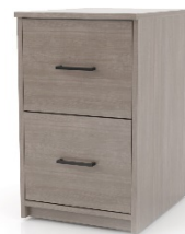
Franklin Mobile Pedestal Two-Drawer FR-MP2-182224 18W x 22D x 24H