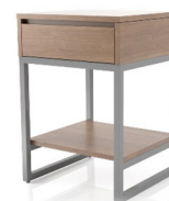
Apex Nightstand AX-NS1-181826-01 18W x 18D x 26H