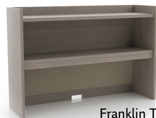
Franklin Two-Shelf Hutch FR-HT2-321224 32W X 12D X 24H