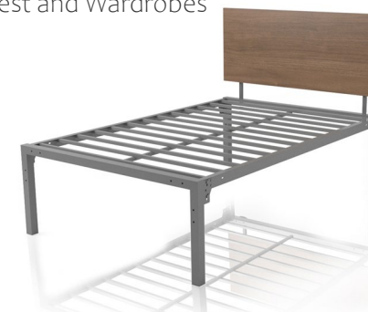
Apex Headboard Full AX-HB-F 53.275W x 2D x 28H Twin and Twin-XL 36W x 2D x 28H Queen 60W x 2D x 33H