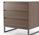
Apex Three-Drawer Chest AX-CH3-302430 30W x 24D x 30H