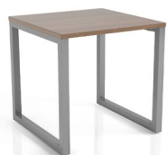
Apex End Table AX-ETF-202020 20W x 20D x 20H