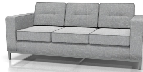
Manhattan Sofa UMHT-SOF 77W X 35D X 32H