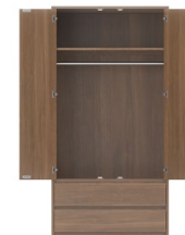
Two-Drawer Wardrobe* AX-WR2-362472 36W x 24D x 72H