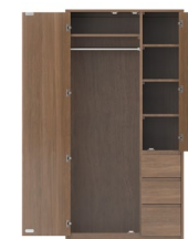
Three-Drawer Wardrobe* AX-WR3-362472 36W x 24D x 72H

* Additional sizes and shelf and drawer options available