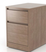
Apex Mobile Pedestal AX-MP2-162224 16W x 22D x 24H