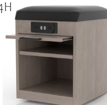
Pedestal One-Drawer with Outlet and Extendable Shelf FR-P1-162122-01 16W X 21D X 22H