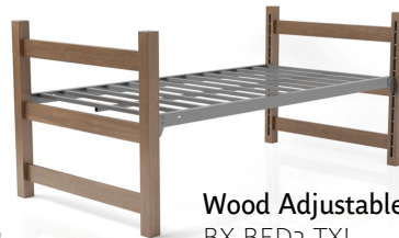
Wood Adjustable Height Bed BX-BED2-TXL 38.5W X 85.75D X 36H Bunkable and Loftable