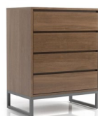
Apex Four-Drawer Chest AX-CH4-341836 34W x 18D x 36H