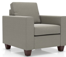
Keystone Lounge Chair UKS-CHR 35W X 35D X 34H

PU-Synthetic leather is created by applying a cover of plastic polyurethane to a base fiber. It more durable and sunlight resistant than animal leather.