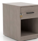
Franklin Mobile Pedestal FR-MP1S2-182430 18W X 24D X 30H