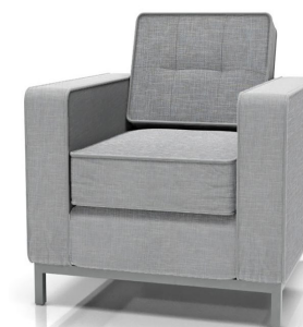
Manhattan Lounge Chair UMHT-CHR 35W X 35D X 32H