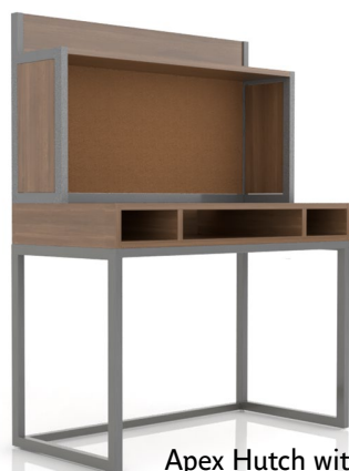
Apex Hutch with Corkboard AX-WDF-421224 42W X 12D X 24H