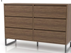
Apex Six-Drawer Chest AX-CH6-541836 54W x 18D x 36H