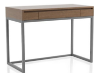
Apex Writing Desk One-Drawer* AX-WD1F-362430 36W x 24D x 30H