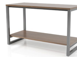
Apex Media Unit AX-MU-401824 40W x 18D x 24H