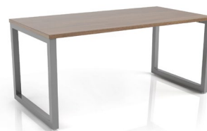
Apex Coffee Table AX-CTF-402018 40W x 20D x 18H