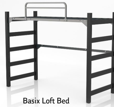
Basix Loft Bed BX-LFT60-TXL 38.5W X 85.75D X 60H Loft Beds and Loft Kits available with Safety Rail