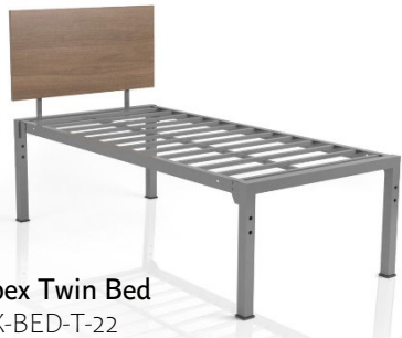
Apex Twin Bed AX-BED-T-22 39W X 77D X 58H Free Standing Beds and Laminate Headboards available in TXL, Full, FXL and Queen