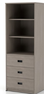
Franklin 3-Drawer 3-Shelf Wardrobe FR-OWR3-222472 22W X 24D X 72H