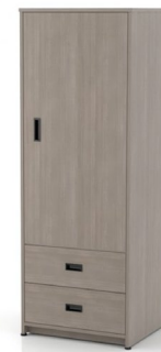
Franklin 2-Drawer Half Wardrobe FR-1WR2-262472 26W X 24D X 72H