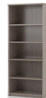
Franklin Five Shelf Bookcase FR-BK5-302430 24W X 15D X 60H