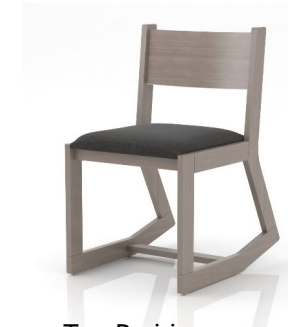
Two-Position Upholstered Seat TPC-WBUS 19W X 25D X 34H