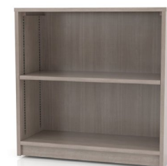
Franklin Mobile Two-Shelf Bookcase FR-BK2C-301330 30W X 13D X 30H