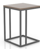
Apex C Tray Table AX-CTT-181825 18W x 18D x 25H