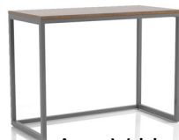
Apex Writing Desk* AX-WDF-402030 40W x 20D x 30H