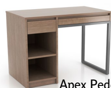
Apex Pedestal Desk* AX-PD2S2-422430 42W x 24D x 30H