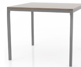
Apex Dining Table AX-DT-363630 36W x 36D x 30H