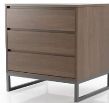
Apex Three-Drawer Chest AX-CH3-302430 30W x 24D x 30H