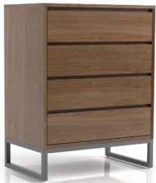
Apex Four-Drawer Chest AX-CH4-341836 34W x 18D x 36H