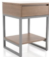
Apex Nightstand AX-NS1-181826-01 18W x 18D x 26H