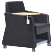
MOB-COCHR Dim: 17"W x 28"D x 30"H