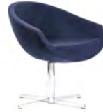
VELA-CHR-CB Dim: 25"W x 25"D x 29"H