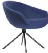
VELA-CHR-SP Dim: 25"W x 25"D x 29"H