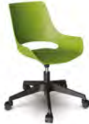
ICON-SC Dim: 20,5"W x 21"D x 30"H