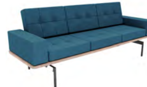
ATK-SOF Dim: 87"W x 27"D x 33"H