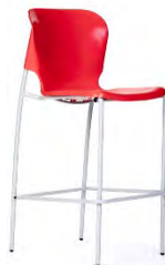
IO 4 legged stool