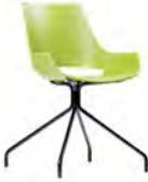
ICON-03 Dim: 20,5"W x 21"D x 31"H