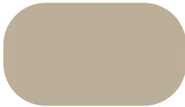
Powder Coating Pantone 7530 U