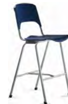
K 4 legged stool