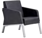
MOB-CHR Dim: 17"W x 29"D x 30"H