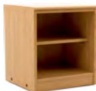
Bedford night stand