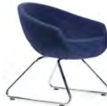
VELA-CHR-SB Dim: 25"W x 25"D x 29"H