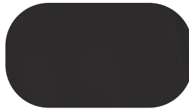
Powder Coating Pantone Process Black C