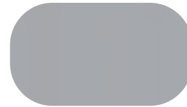
Powder coating Pantone Cool Gray 6 C