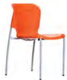
IO 4 legged chair