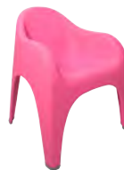
Juga upholstered chair