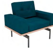
ATK-CHR Dim: 39"W x 27"D x 33"H