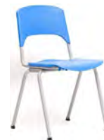
K 4 legged chair