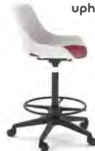
ICON-SCUS-BS Dim: 20,5"W x 21"D x 48"H