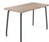
HOME-SOT-472329 Dim: : 47"W x 23"D x 29"H