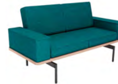
ATK-LUV Dim: 51"W x 27"D x 33"H