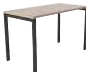
HOME-DT-472329 Dim: : 47"W x 23"D x 29"H