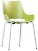
ICON-04 Dim: 20,5"W x 21"D x 31"H