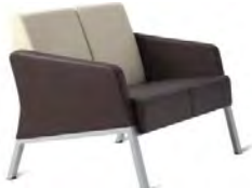
2 Seats MOB-LUB Dim: 49"W x 29"D x 30"H