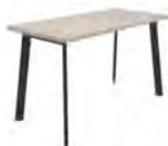
HOME-DTT-472329 Dim: : 47"W x 23"D x 29"H